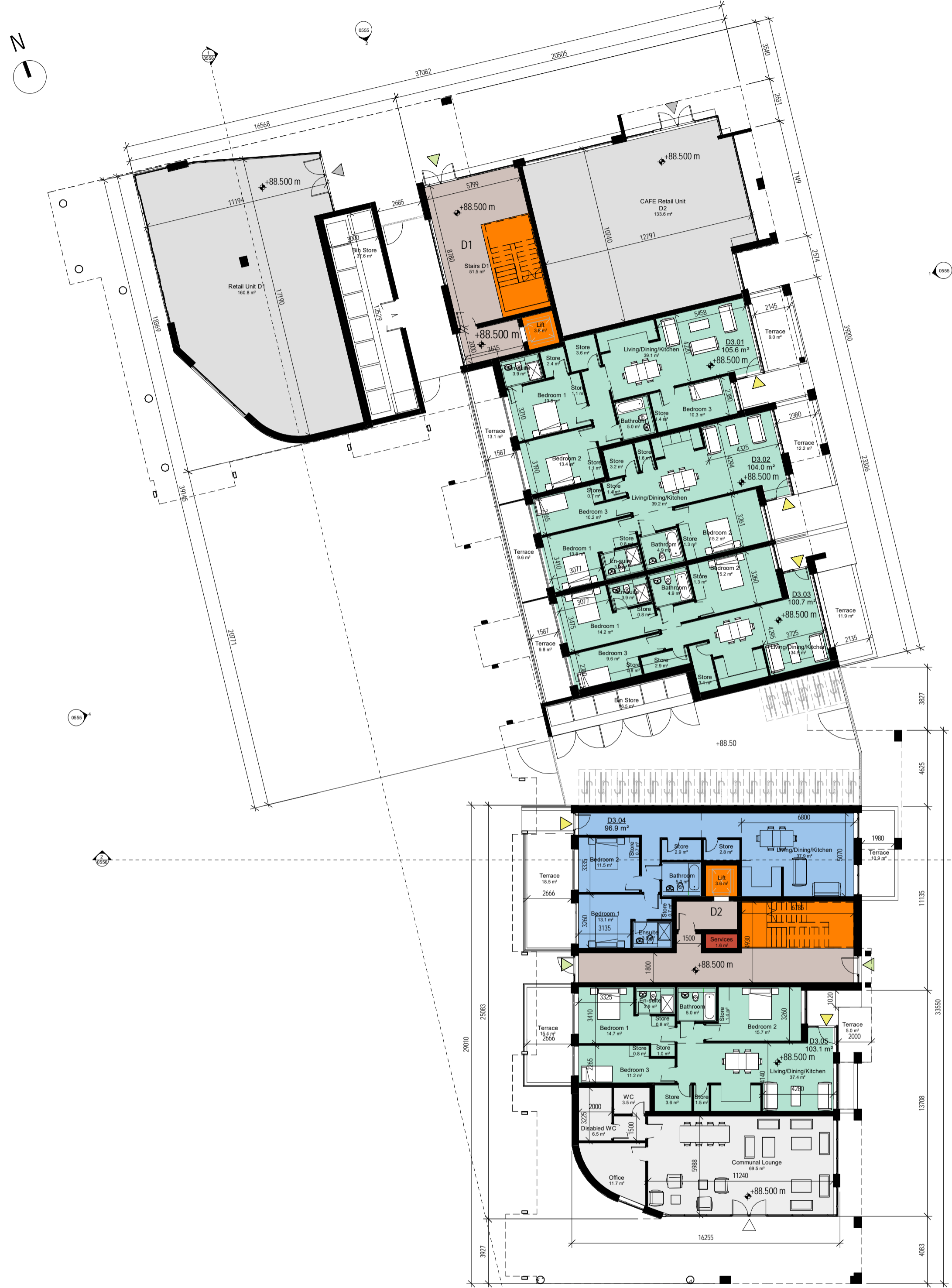
Block D - Proposed Ground Floor Plan 1 : 200

GENERAL NOTES: ALL DIMENSIONS ARE TO BE CONFIRMED ON SITE DIMENSIONS ARE NOT TO BE SCALED FROM THIS DRAWING THIS DRAWING IS TO BE READ IN CONJUNCTION WITH CONSULTANTS DRAWINGS ALL WORK TO BE CARRIED OUT IN ACCORDANCE WITH CURRENT BUILDING REGULATIONS