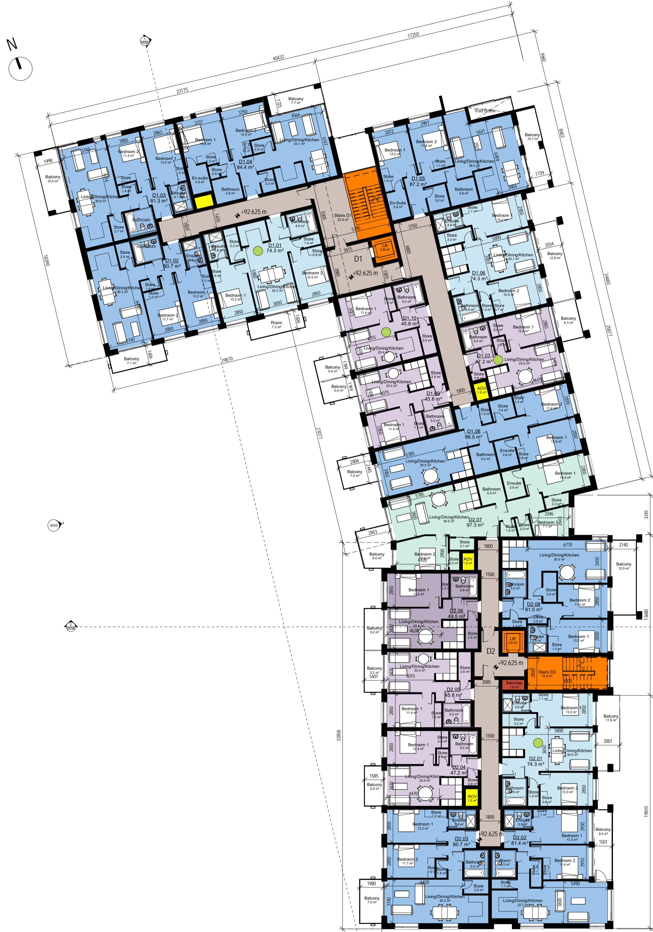
Block D - Proposed First Floor Plan 1 : 200